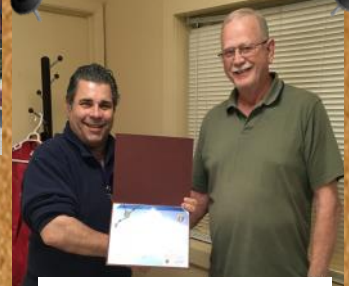
Welcome new member