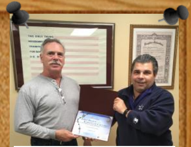
Welcome new member